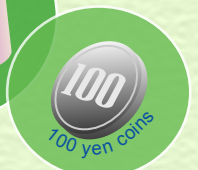
100 100 yen coins